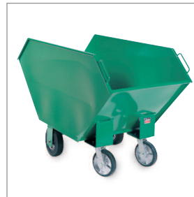
Steel Hopper Truck