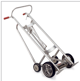
Ezy-Rol 4-Wheel Drum Trucks