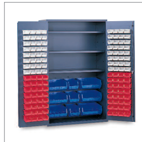
Vari-Tuff High-Capacity 48"W Bin Cabinet