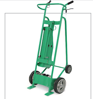
Heavy-Duty Powered Hand Truck