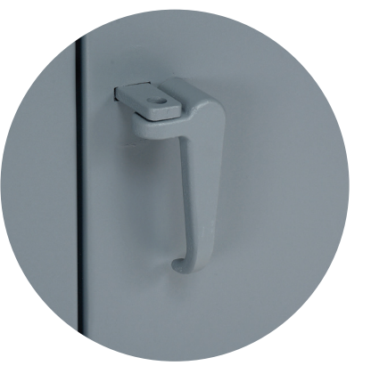
Cast handle accepts padlock to provide maximum security to valuable equipment.

12-guage extra heavy duty cabinets are all-welded. Bolt-in shelves accomodate various sized items, with an individual shelf capacity up to 1900 lbs. Doors swing on 7 gauge leaf hinges to prevent twisting and sagging. Cabinets include three-point steel locking system with 3/8" diameter rods.