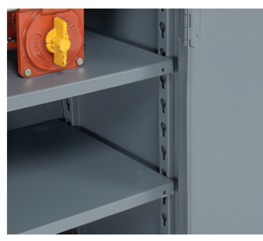
Bolt-in cabinet shelves adjust on 2-1/2" centers to accommodate various sized items.