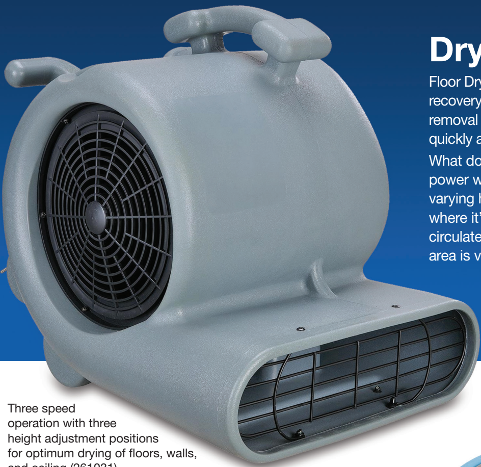
Three speed operation with three height adjustment positions for optimum drying of floors, walls, and ceiling (261031)

Floor Dryers are used for everything from flood recovery efforts, restoration, and mold and mildew removal when making sure you remove excess water quickly and effectively is of the utmost importance. What do you need? You need constant drying power with the flexibility of varying speeds and varying height levels so you can direct drying air where it's needed. Portable dryers will dry and help circulate hot air around a room – but make sure the area is ventilated so moist air can escape.