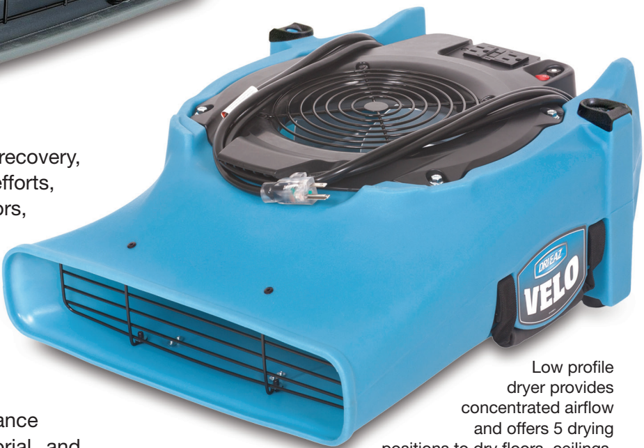
Low profile dryer provides concentrated airflow and offers 5 drying positions to dry floors, ceilings, walls and stairways quickly and efficiently. (B1032911)

Floor dryers are not only used for flood recovery, mold and mildew prevention or removal efforts, they can be used for general drying for floors, wall, ceilings, drapes, and upholstery as well. Low profile air movers are compact and powerful that function vertically or horizontally for easy stacking and storage. High static airflow moves quickly for thorough drying. Centrifugal Air Movers have a fully integrated housing, and motor and parts design for balance and performance for restoration to janitorial and sanitation. • Multiple speeds provide versatile drying needs • 3-5 positions allows drying multiple areas or levels • Built in handle lets you carry, move, or stack dryers