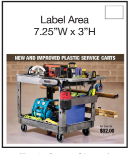
(Back Cover Shown)

• PDF version will be available to download